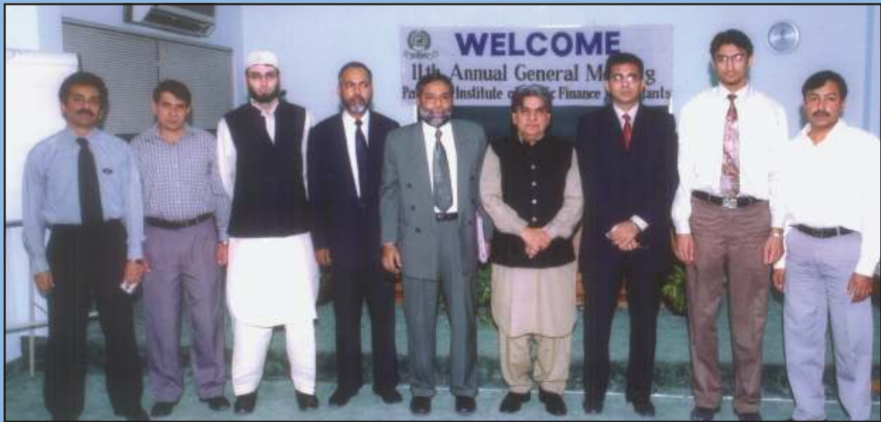
Participants at 11th AGM of PIPFA